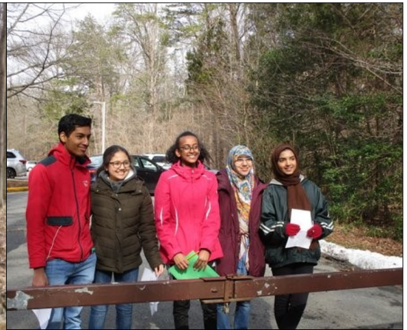
Students from Edison High School National Honor Society relax after spending hours picking up trash on Lockheed Blvd. and Harrison Lane during the January 26, 2019 Adopt-A-Highway program.