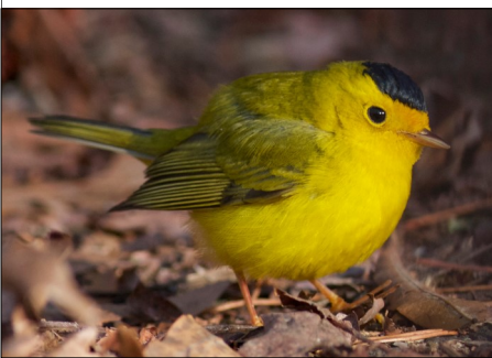
Patient observers of sound and color might be treated to a rare sight in HMP like this Wilson's Warbler.

Did you notice? It is almost here! I'm talking about springtime. This is a very special time of year for us to tune up our observation skills and see spring come forward and show itself to us. Green shoots will start to peek out from underneath the leaf litter. The trees will begin to show buds, and our resident birds will begin singing more often as they claim their nesting territories. Watching waves of color begin to appear when looking at trees from a distance is an early indicator that spring is just around the corner. If you are lucky enough to be flying in an airplane heading southward, have a look out the window and you'll see reddish colors of the tree buds from the air.