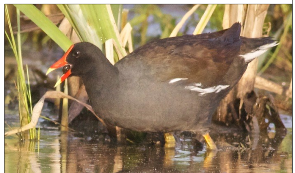
The Common Moorhen is a shy bird. It requires careful observation skills to catch a glimpse of one.

NOTE - Lots of spring programs are scheduled at HMP. There is a list of upcoming programs in this newsletter! Come and visit! We hope to see you soon!