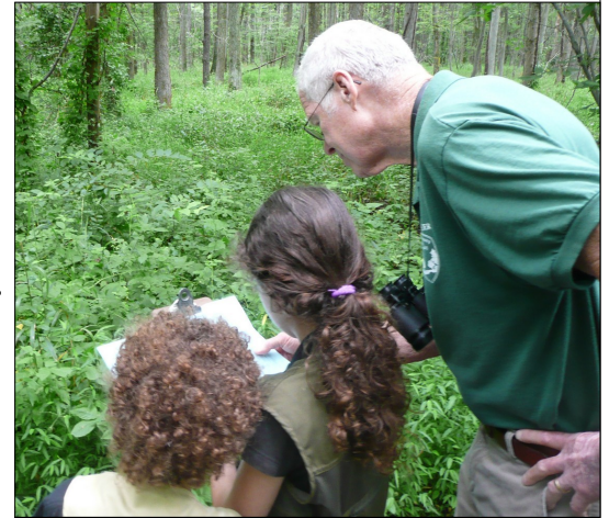
A volunteer helping children identify their findings.

Did your child join in the camp program? Volunteers, including interns, assist Park staff with camps and other children's programs throughout the year.