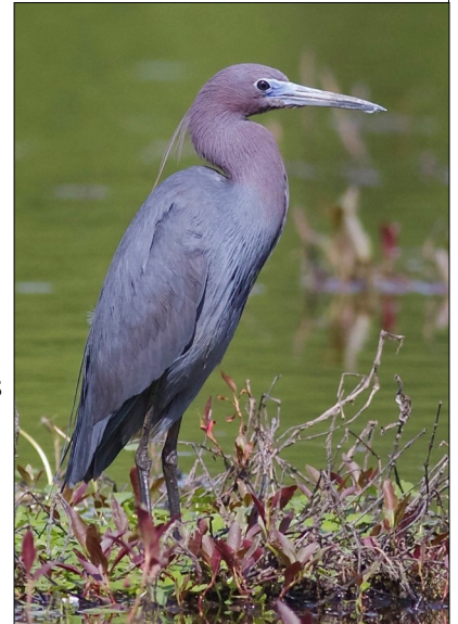
A Little Blue Heron, photo by Ed Eder, can easily be seen at HMP when it visits in the summer. New acoustic monitoring equipment will help staff find what’s not so easily seen.

This Wildlife Acoustic grant has significantly reduced the financial cost to FOHMP of this system by covering the purchase of the acoustic monitoring system equipment. With this hardware delivered and software purchased through member donations, FOHMP is very much looking forward to having this acoustic monitoring system in place and learning more about what can be found in the wetland!