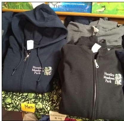
Zip up hoodies!

New merchandise! The Friends of Huntley Meadows Park (FOHMP) is now offering zip up hoodies in navy blue, gray and black!