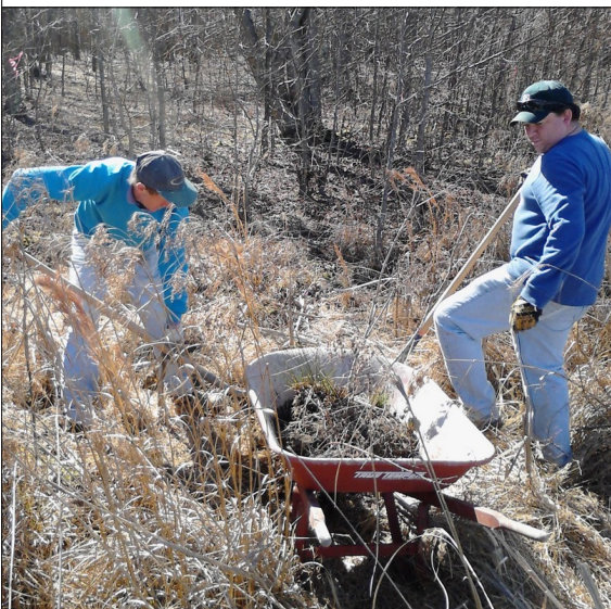
Volunteers saving unique and ecologically important plants before the 2014 restoration project.

Have you taken a tour of T.F. Mason's villa at Historic Huntley? Volunteers assist in maintaining the house, lead tours, and assist with other Historic Huntley programs.