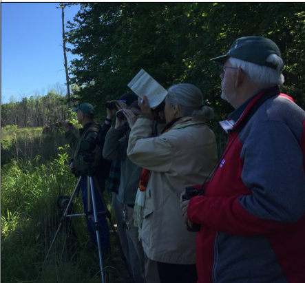
Volunteers hoping to add to their bird count.