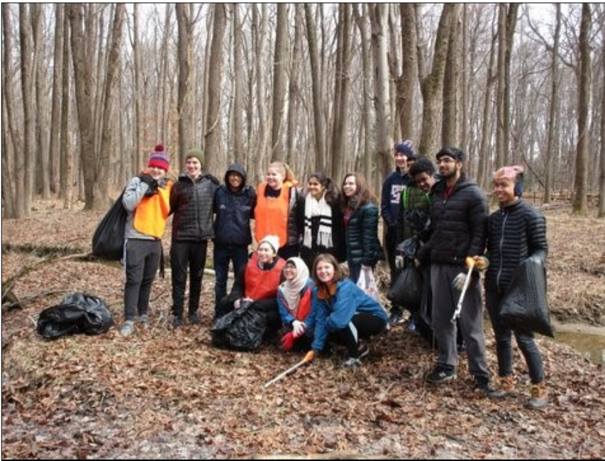
Students from Edison High School National Honor Society pose with some of the bags of trash they picked up during the January 26, 2019 cleanup event.